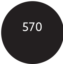
Luminous flux per meter