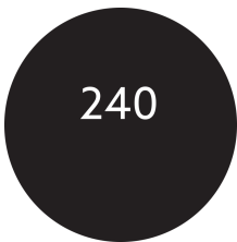
Output power range