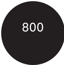
Luminous flux per meter