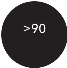
Colour rendering index CRI