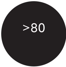
Colour rendering index CRI