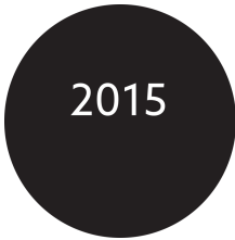
Luminous flux per meter