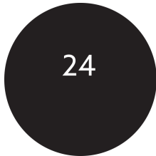
Output voltage range