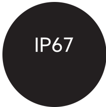
Degree of protection (IP)