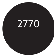
Luminous flux per meter