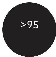
Colour rendering index CRI