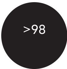
Colour rendering index CRI