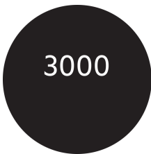
Luminous flux per meter