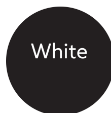
Colour of light