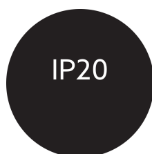
Degree of protection (IP)