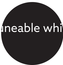
Colour of light